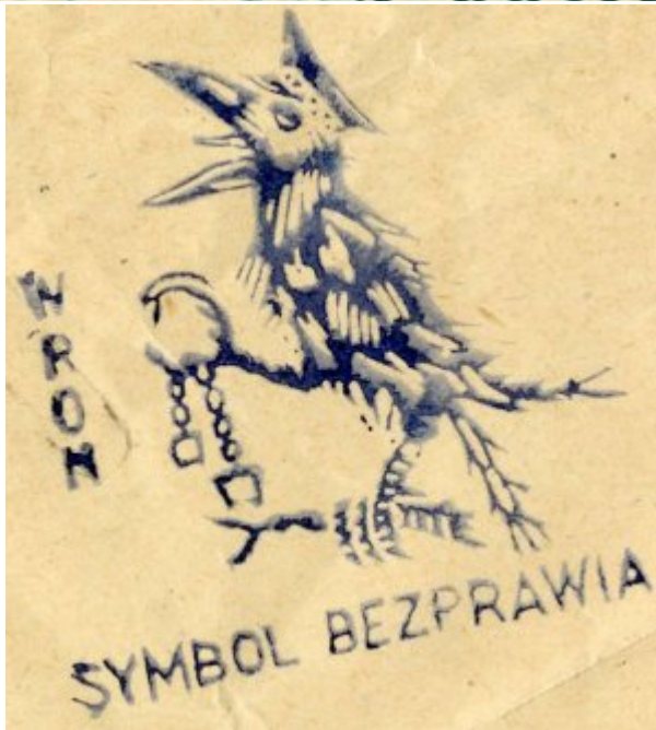
"WRON - the sybol of lawlessness"