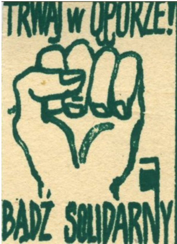
"Remain in resistance! Be solidary"