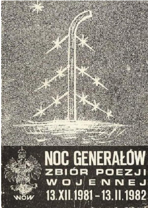
"The night of the generals" - a collection of war poetry